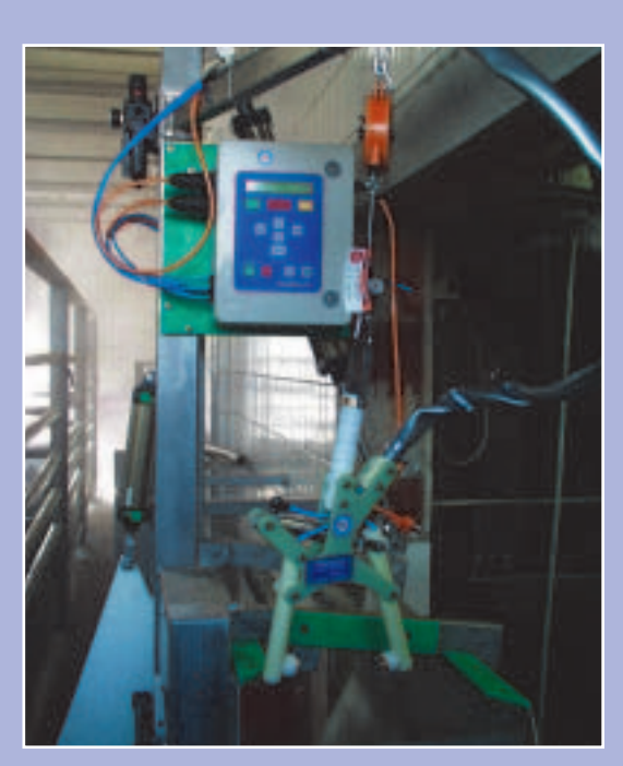
Stunning device FBT 2000 A, in combination with various stunning traps and pneumatic tong FBTZ

Years of experience in animal stunning in combination with a professional microprocessor-based control ensure top quality and minimize damage caused by slaughter