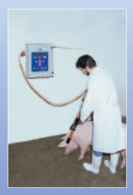
Stunning device FBT 2000 B with stunning tong EBZ

for use in the stunning bay - save and fast stunning of pigs and sheep