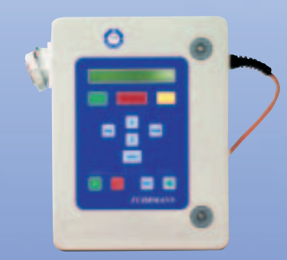
Stunning device FBT 2000 B with microprocessor based control