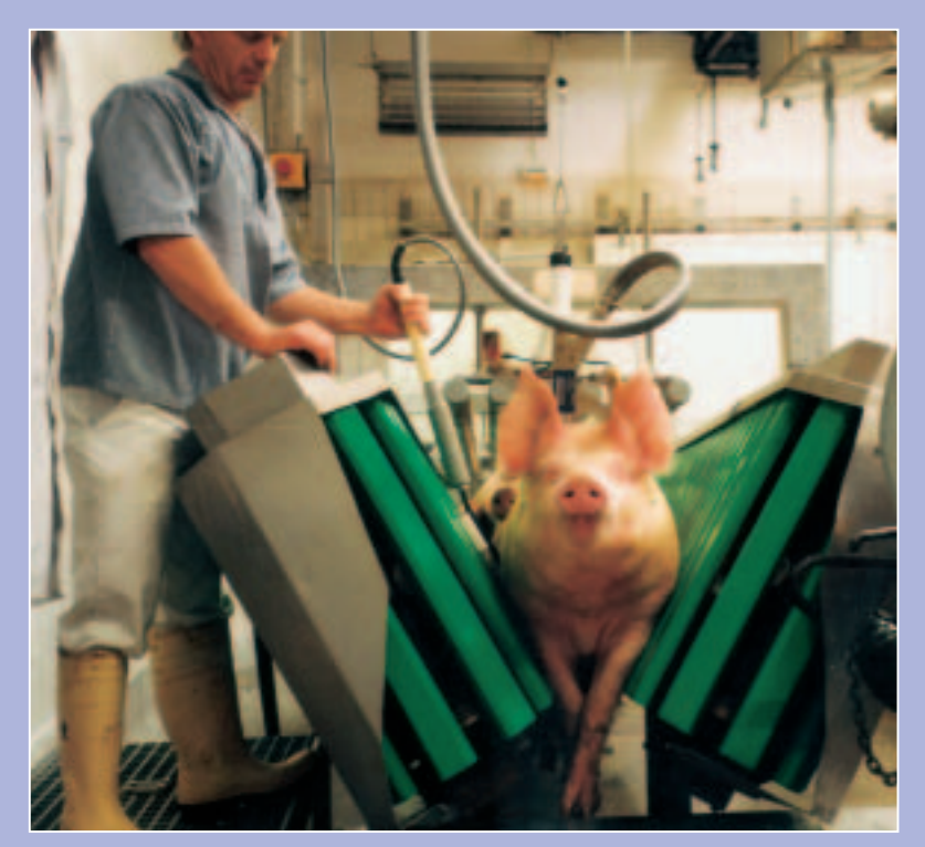
Stunning device FBT 2000 A in combination with restrainer, pneumatic stunning tong FBTZ and manual heart electrode

Years of experience in animal stunning in combination with a professional microprocessor-based control ensure top quality and minimize damage caused by slaughter