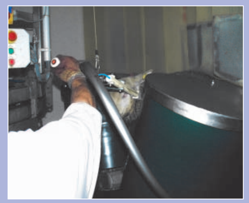
Stunning device FBT 2000 A with pneumatic tong FBTZ in combination with restrainer for the stunning of sheep