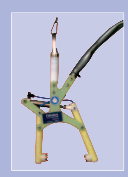
Pneumatic stunning tong FBTZ for stunning traps and restrainer

Humane restraining units require a flexible and highly efficient stunning device. We will give you advice and together we will find an optimal and complete solution for your slaughterhouse.